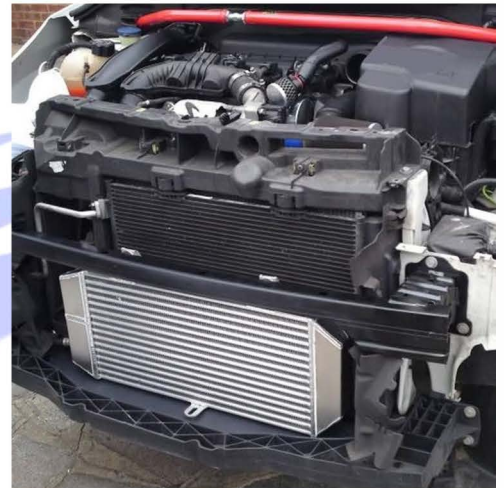
Condenseur de climatisation